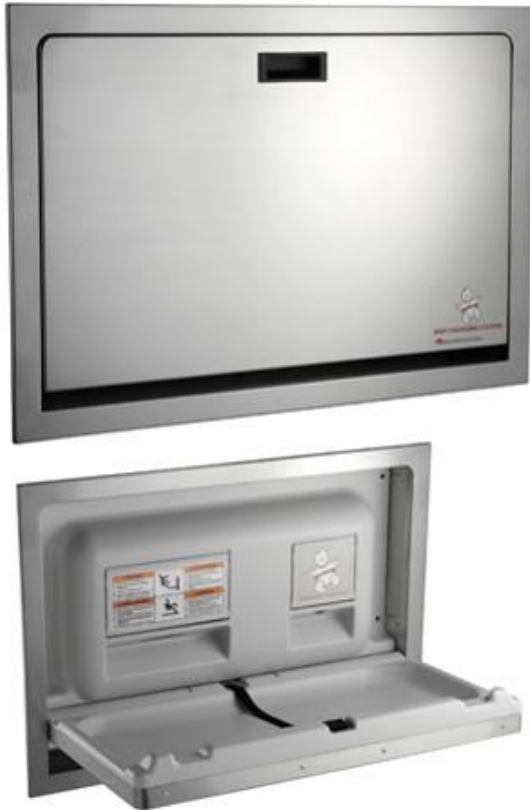
*Recessed Unit Shown Above