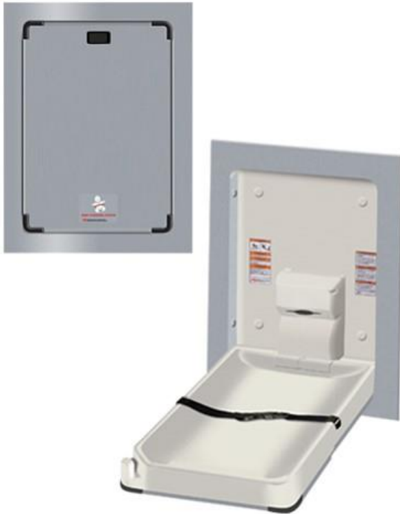
*Recessed Unit Shown Above