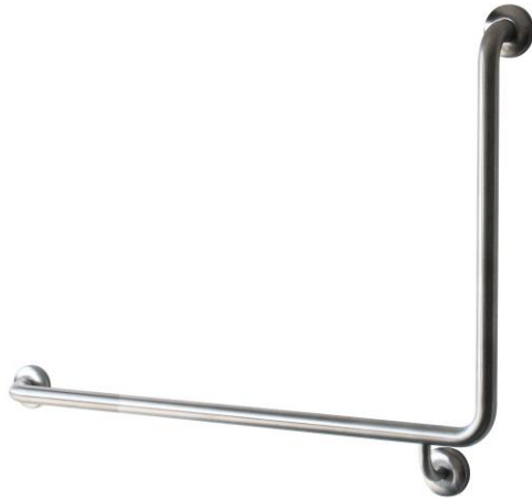
*Left Handing image shown above and below.